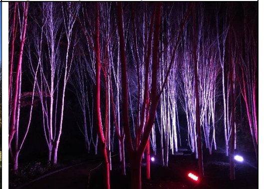
December – Winter Lights (AA)