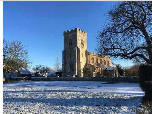
January – Comberton in lockdown