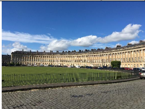
October – Bath – Royal Crescent