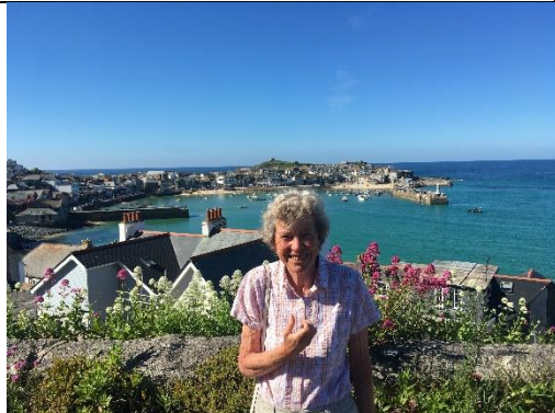
June – St Ives Cornwall during G7