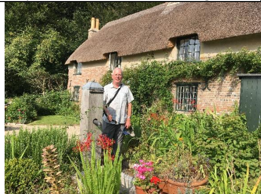
September – Hardy's birthplace cottage