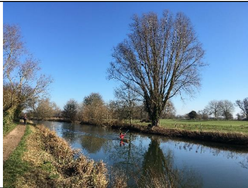
February – Cam near Milton