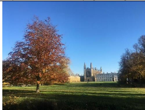
November – Cambridge - Kings