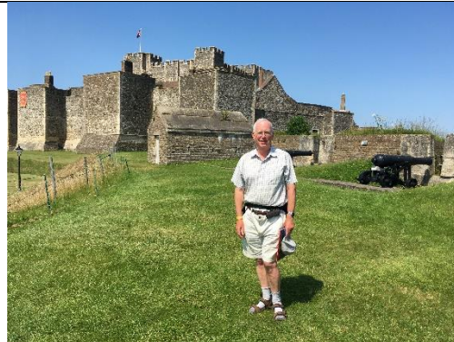
July – Dover Castle (staying in Sandgate)