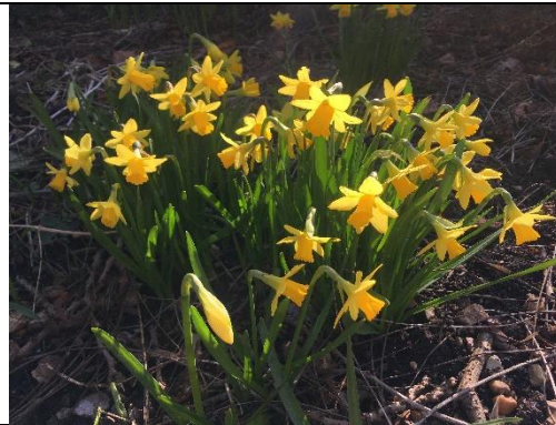
March – Thriplow daffodils