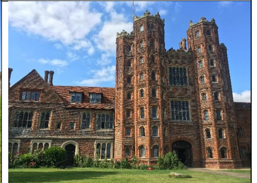
August – Layer Marney Tower – Airbnb!