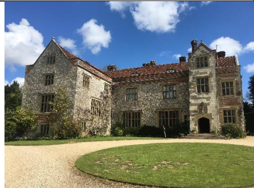
May – Chawton – Jane Austen big house